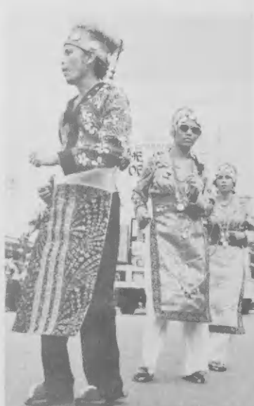
Esso Club's "The Hmong of Laos"